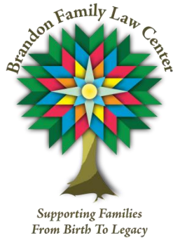
Brandon Family Law Center